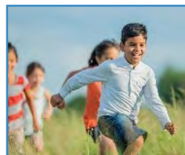
Children's Environmental Health