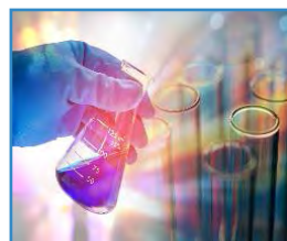
Contaminants of Immediate and Emerging Concern